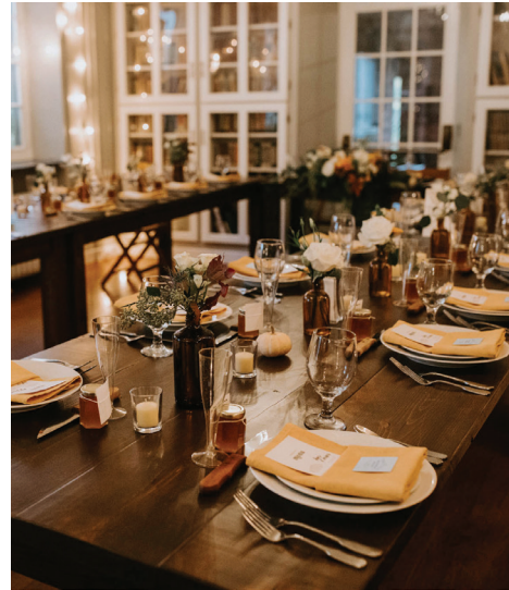
K. CUTRIGHT WEDDING COORDINATION + DESIGN