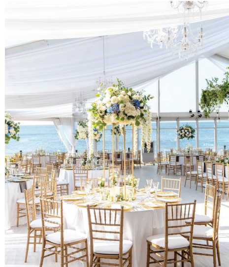
ONE RED DOOR PHOTOGRAPHY